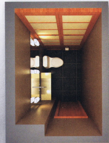
Rendering by Waypoint™ Living Spaces

All About Kitchens and More! Sacramento, CA